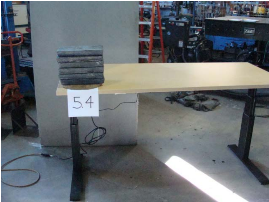
Photo No. 4 - Section 5.4 Concentrated Proof Load Test