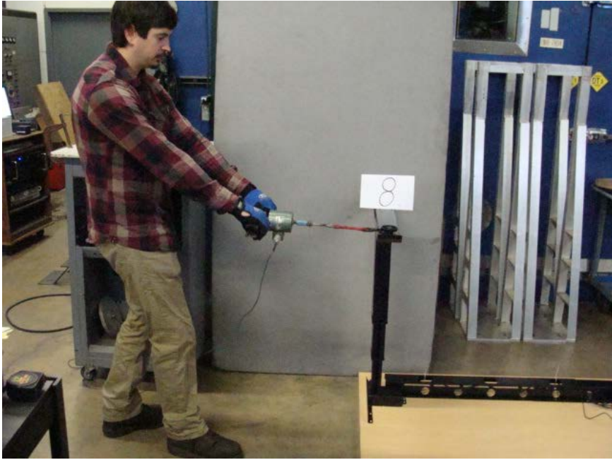
Photo No. 8 - Section 8 Leg Strength Test