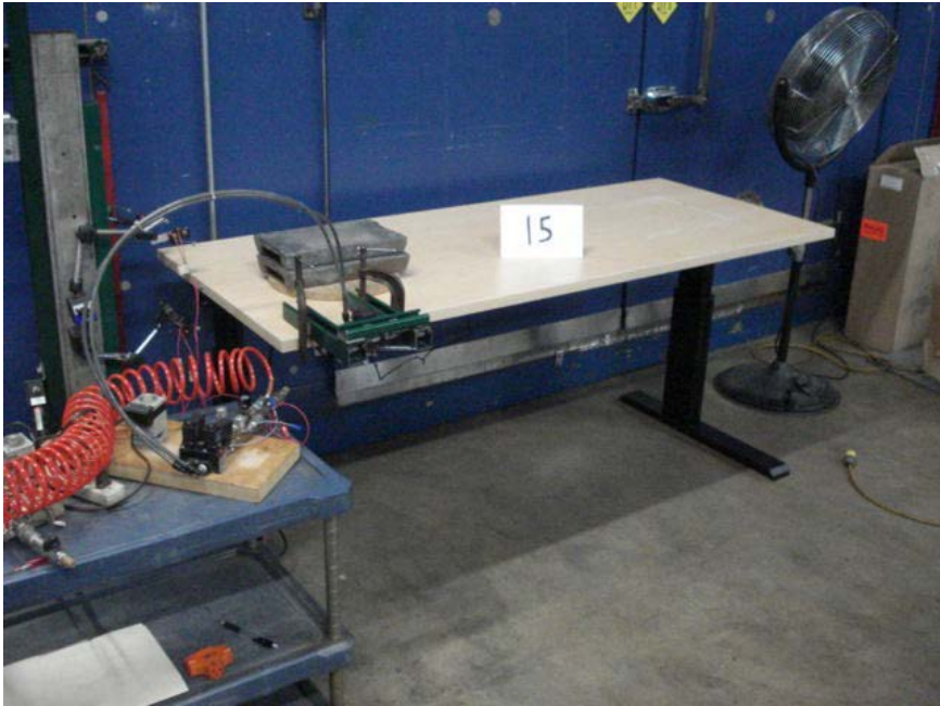
Photo No. 9 - Section 15 Work Surface Vertical Adjustment Test