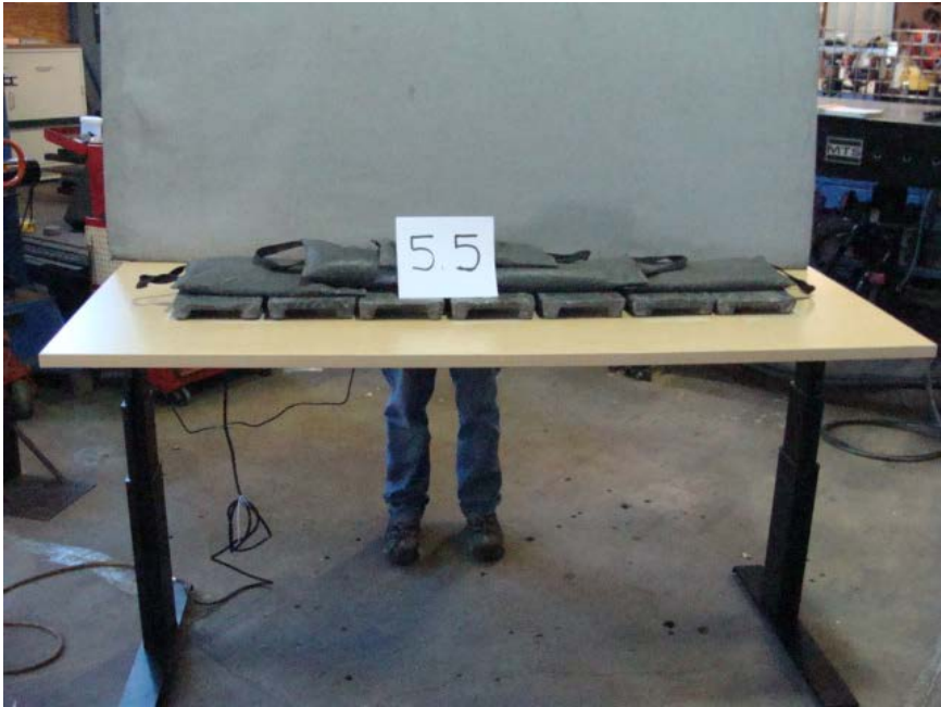
Photo No. 5 - Section 5.5 Distributed Proof Load Test