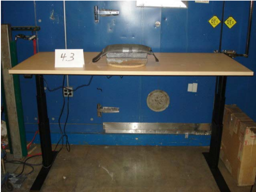
Photo No. 1 - Section 4.3 Stability Under Vertical Load Test