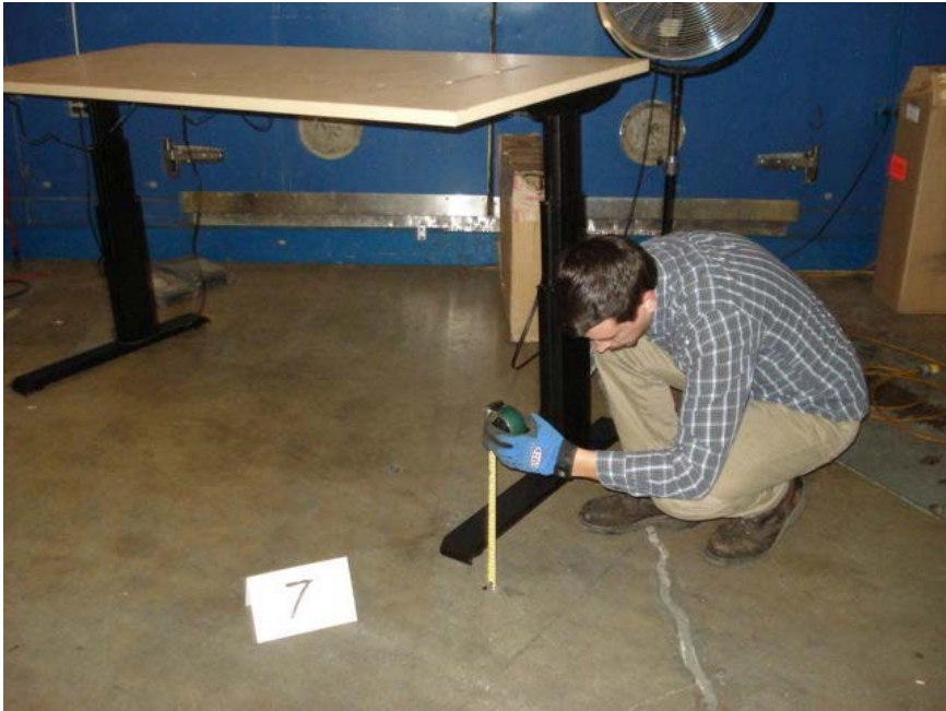
Photo No. 7 - Section 7 Desk/Table Unit Drop Test