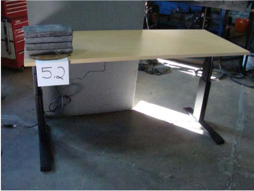
Photo No. 2 - Section 5.2 Concentrated Function Load Test