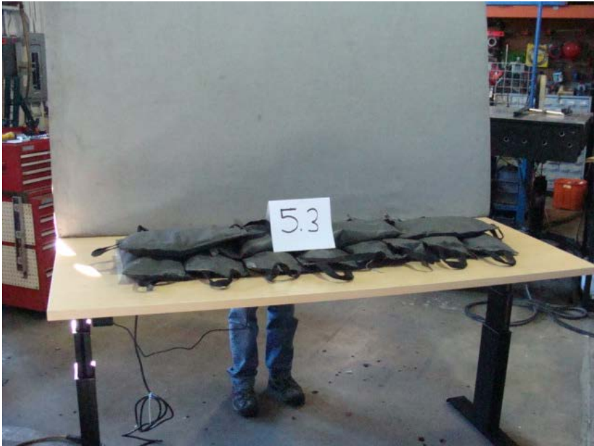
Photo No. 3 - Section 5.3 Distributed Function Load Test