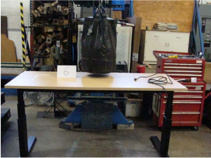
Photo No. 6 - Section 6 Top Load Ease Cycle Test